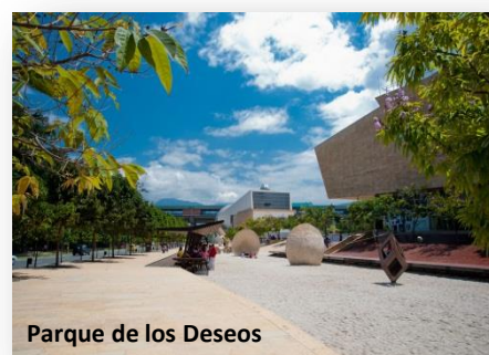
Parque de los Deseos