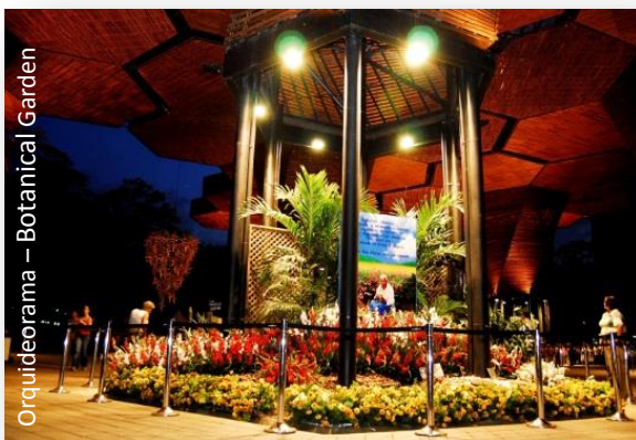
Orquideorama – Botanical Garden

“Orquideorama” at the Botanical Garden: an astonishing and huge structure built under an extraordinary architectural style (bee hive form), an immense green house of 5,000 square meters (53,820 square ft 2 ).